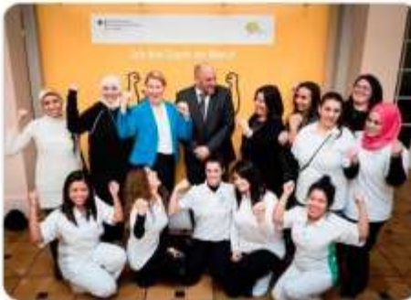
„Federal Minister for Family Affairs Dr. Franziska Giffey with participants of the programme“

The project refers to the fact, that 31% of all mothers in Germany have a migrant background, only 52% have a job; this number has continuously been increasing within the last years. However, at the same time more than 400,000 of these women would immediately start